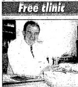
Free clinic Low-cost medical clinic out out plea for help